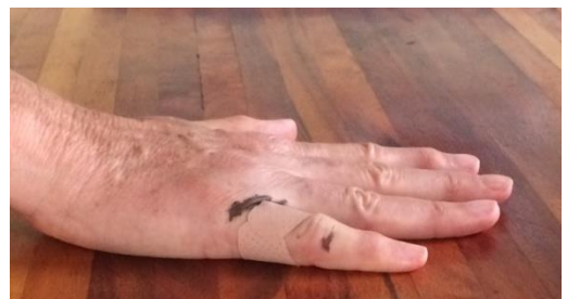
3 weeks after manipulation. The black marks are from the silver nitrate not bruising.