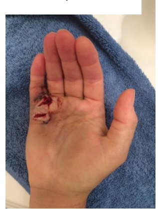
3 days after manipulation